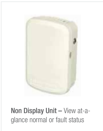
Non Display Unit – View at-a-glance normal or fault status

USB Port – Update display graphics with logo and contact information; allow future uploads of product enhancements