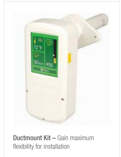
Ductmount Kit – Gain maximum flexibility for installation